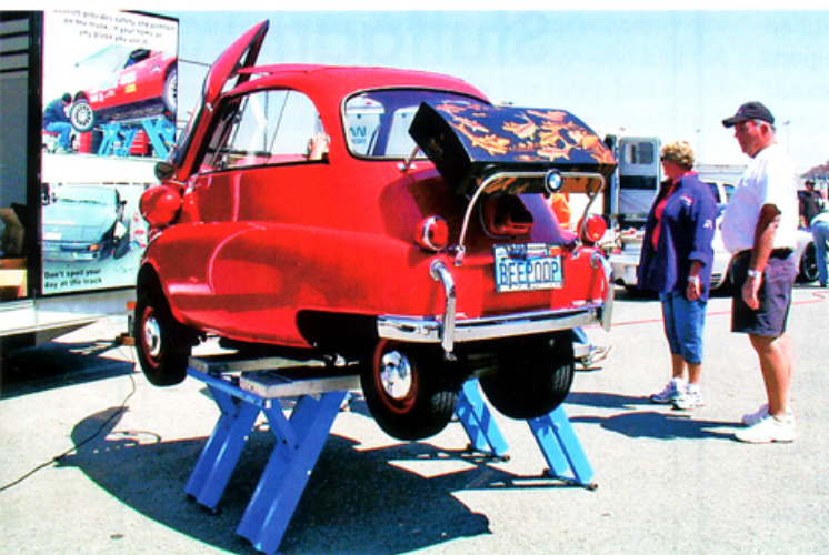
The race directors' pit cart—up for scrutineering. It was accepted to run in stock class R, along with bicycles and large-wheeled trikes.

That roster alone would be enough to make a weekend a great success, but then you add in the California Speedway at Fontana, a Penske track that has all the facilities and amenities you'd expect with the Roger's name on the chair-